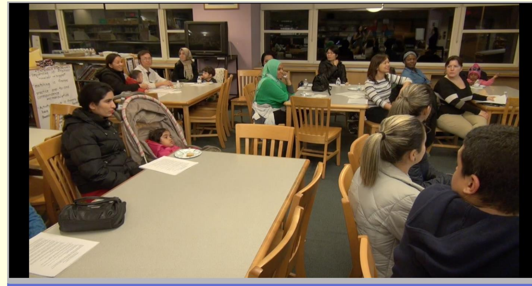
Jan 2017 Parent Academy