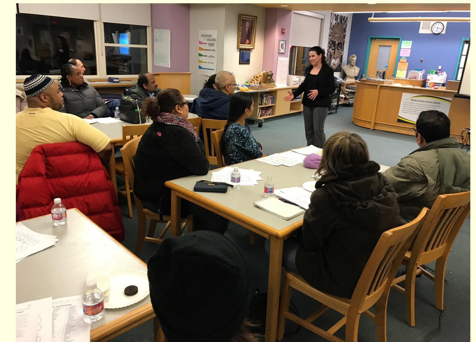
Jan 2018 Parent Academy